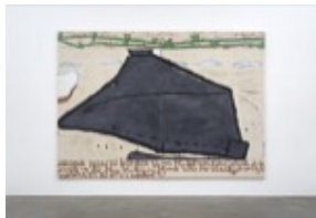
Rose Wylie Stealth Bomber , 2016 Oil on canvas in two (2) parts Overall: 93 3/4 x 132 3/8 inches 238 x 336 cm Each part signed verso WYLRO0026A