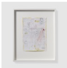
Rose Wylie Cuban Dancers & Backup Singers , 2016 Colored pencil and collage on paper 11 3/4 x 8 1/2 inches 29.7 x 21.4 cm Framed: 18 3/8 x 15 x 1 5/8 inches 46.5 x 38 x 4 cm Signed verso WYLRO0024A