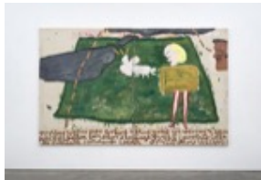
Rose Wylie Volcano, Pig, Cigar-Man , 2016 Oil on canvas 93 3/4 x 132 3/8 inches 238 x 336 cm Each part signed verso WYLRO0027A