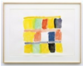
Stanley Whitney Untitled, 2013 Gouache on paper 22 x 30 1/4 inches 55.9 x 76.8 cm 17 1/8 x 21 1/4 x 1 3/8 inches (framed) 43.5 x 54 x 3.5 cm Signed, dated, and inscribed verso WHIST0010