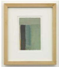
Ilse D'Hollander Untitled, 1996 Gouache on paper 6 3/4 x 4 1/2 inches 17.1 x 11.4 cm 12 7/8 x 11 x 1 inches (framed) 32.7 x 27.9 x 2.5 cm DHOIL0002