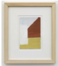
Ilse D'Hollander Untitled, 1996 Gouache on paper 6 3/4 x 4 1/2 inches 17.1 x 11.4 cm 13 x 11 x 1 inches (framed) 33 x 27.9 x 2.5 cm DHOIL0003