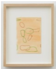
Raoul De Keyser Untitled, 2000 Pencil and watercolor on paper 7 1/16 x 4 7/8 inches 17.9 x 12.2 cm 12 1/8 x 9 7/8 x 1 3/8 inches (framed) 30.8 x 25.1 x 3.5 cm Initialed and dated lower recto; signed, dated, and inscribed verso DEKRA0254