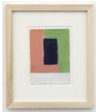
Ilse D'Hollander Untitled , 1996 Gouache on paper 6 7/8 x 5 inches 17.5 x 12.7 cm 13 x 11 x 1 inches (framed) 33 x 27.9 x 2.5 cm DHOIL0006