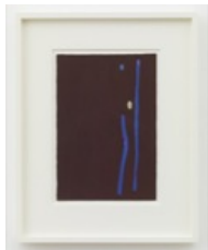
Paulo Monteiro Untitled, 2012 Gouache and watercolor on paper 11 x 7 1/2 inches 28 x 19 cm 17 1/4 x 13 5/8 x 1 3/8 inches (framed) 43.8 x 34.6 x 3.5 cm Signed and dated lower left recto MONPA0005