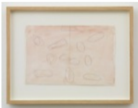
Raoul De Keyser Untitled, 2000 Pencil and watercolor on paper 8 7/16 x 12 5/8 inches 21.5 x 32 cm 13 1/2 x 17 3/4 x 1 3/8 inches (framed) 34.3 x 45.1 x 3.5 cm Initialed and dated lower right recto; signed, dated, and inscribed verso DEKRA0253