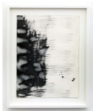
Rebecca Morris Untitled (#154-13), 2013 Ink and watercolor on paper 16 1/8 x 12 13/16 inches 41 x 32.5 cm 20 x 16 x 1 1/2 inches (framed) 50.8 x 40.6 x 3.8 cm Signed, titled, dated, and inscribed verso MORRE0006