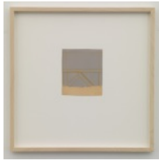
James Bishop Untitled , 2009 Oil and crayon on paper 4 3/4 x 4 1/4 inches 12.3 x 10.8 cm 15 x 15 x 1 inches (framed) 38.1 x 38.1 x 2.5 cm BISJA0023