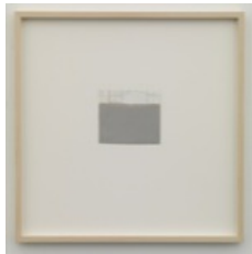
James Bishop Untitled , 2011 Oil and crayon on paper 4 x 4 1/2 inches 10 x 11.3 cm 16 1/2 x 16 1/2 x 1 inches (framed) 41.9 x 41.9 x 2.5 cm BISJA0022