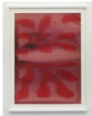
Rebecca Morris Untitled (#219-13), 2013 Ink and watercolor on paper 23 15/16 x 17 13/16 inches 60.8 x 45.2 cm 27 5/8 x 21 1/2 x 1 1/2 inches (framed) 70.2 x 54.6 x 3.8 cm Signed, titled, dated, and inscribed verso MORRE0007