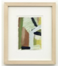
Ilse D'Hollander Untitled, 1996 Gouache on paper 6 7/8 x 5 inches 17.5 x 12.7 cm 13 x 11 x 1 inches (framed) 33 x 27.9 x 2.5 cm DHOIL0005