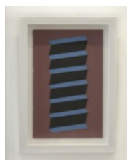
Ben Berlow Untitled, 2013 Gouache on paper 7 3/8 x 4 3/4 inches 18.7 x 12.1 cm 9 1/4 x 6 5/8 x 3/4 inches (framed) 23.5 x 16.8 x 1.9 cm Signed verso BERBE0014