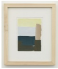
Ilse D'Hollander Untitled , 1996 Gouache on paper 7 x 5 inches 17.8 x 12.7 cm 13 x 11 x 1 inches (framed) 33 x 27.9 x 2.5 cm DHOIL0007