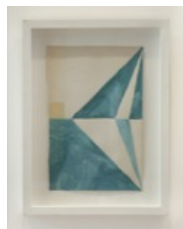
Ben Berlow Untitled, 2013 Gouache on paper 8 7/8 x 6 inches 22.5 x 15.2 cm 12 x 9 x 1 1/4 inches (framed) 30.5 x 22.9 x 3.2 cm Signed verso BERBE0012