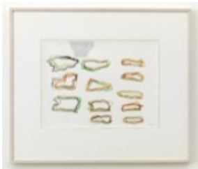
Raoul De Keyser Untitled, 1999 Watercolor and pencil on paper 12 3/4 x 17 inches 32.4 x 43.2 cm 22 3/8 x 26 1/4 inches (framed) 56.8 x 66.7 cm Initialed lower right recto DEKRA0103