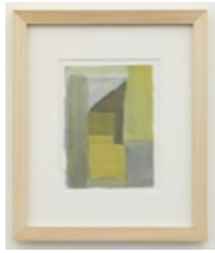
Ilse D'Hollander Untitled, 1996 Gouache on paper 6 7/8 x 5 1/8 inches 17.5 x 13 cm 13 x 11 x 1 inches (framed) 33 x 27.9 x 2.5 cm DHOIL0004